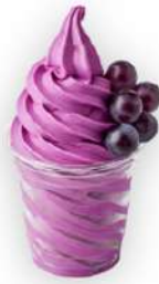
Ice cream Grape