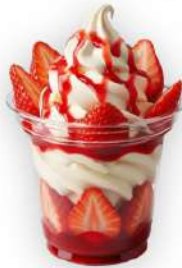
Super Strawberry Sundae