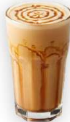
Toffee Hazelnut Milk Tea