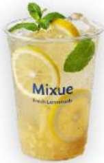
Mixue Fresh Lemonade