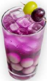
Taro Ball Grape