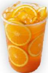
Cheese Bobo Milk Tea