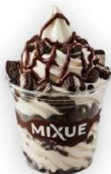
Super Cookies Sundae