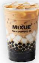
Twin Topping Milk Tea