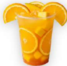
Pearl Milk Tea