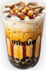
Brown Sugar Pearl Milk Tea