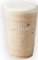
Oats Milk Tea