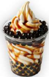
Brown Sugar Pearl Sundae