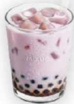
Taro Ball Milk Tea