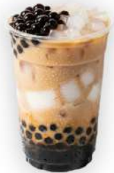
Milk Tea with 2 Toppings