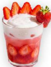
Milk Foam Strawberry