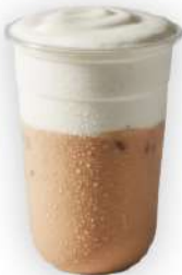
Super Triple Milk Tea