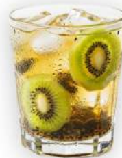
Kiwi Oolong Tea