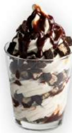
Super Chocolate Sundae