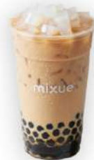
Coconut Jelly Milk Tea