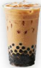
Pearl Milk Tea