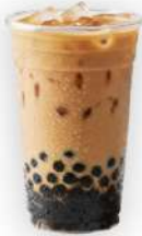
Taro Ball Milk Tea