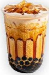
Brown Sugar Pearl Milk Tea