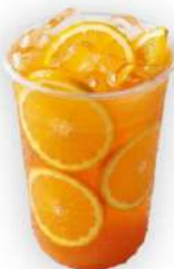
Punched Fresh Orange