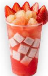
Taro Milk Tea