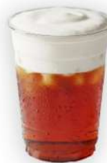
Milk Foam Oolong Tea