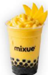
Coconut Mango with Taro