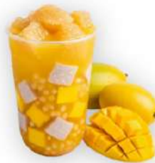
Coconut Jelly Milk Tea