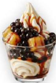
Brown Sugar Pearl Sundae