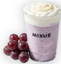
Cheese Grape Smoothies