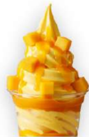
Super Mango Sundae