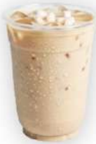
O-coco Milk Tea