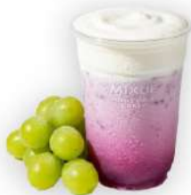
Milk Foam Grape