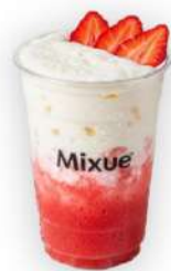
Strawberry Jasmine Tea