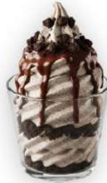
Cocoa Cookie Sundae