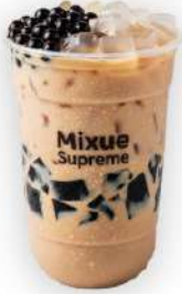
Supreme Mixed Milk Tea