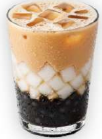
Coconut Jelly Milk Tea