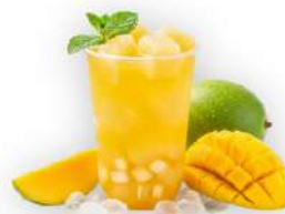
Mango Pomelo Taro