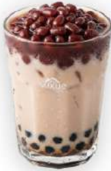
Red Bean Milk Tea