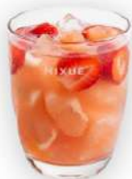
Strawberry Pomelo Taro