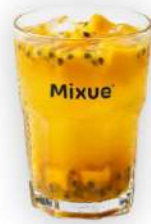
Passion Fruit Mango